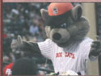
Rocky the Rock Cat!