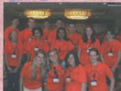
Region 1 delegates: Connecticut, Maine, Massachusetts, New Hampshire, Rhode Island and Vermont!