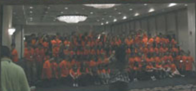
All the Youth delegates!