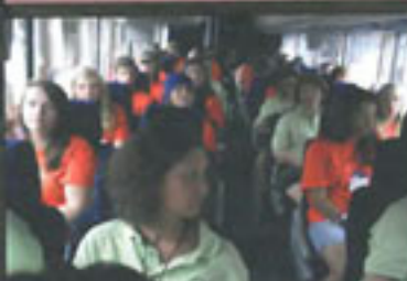
Bus Tour of Katrina Disaster